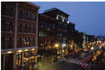
Exhibit and Sponsorship Brochure